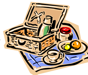
West Chester Area Senior Citizens Picnic to support the Senior Center

Restoration of the Blacksmith Shop in East Goshen, Goshen Fire Company, Junior Achievement, Little League, West Chester Girls Softball, PAL of West Chester, Seven Oaks Fire Relief, Stetson Middle School Outdoor Education Program, West Chester Area